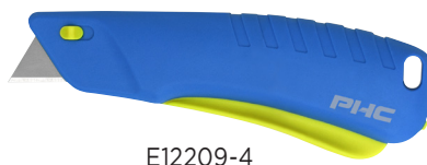
E12209-4 Auto-Retract Rebel™ Safety Knife