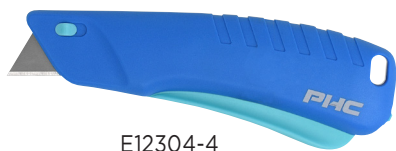
E12304-4 Smart-Retract Rebel™ Safety Knife